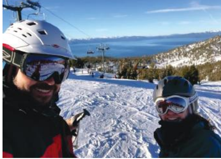
Mesquits Skiing at Lake Tahoe